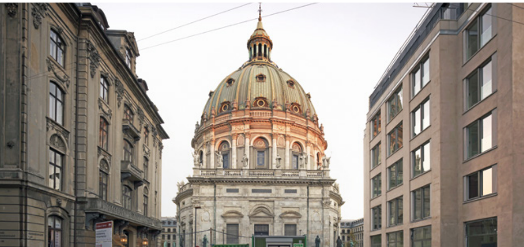
→ Bispebjerg Bakke