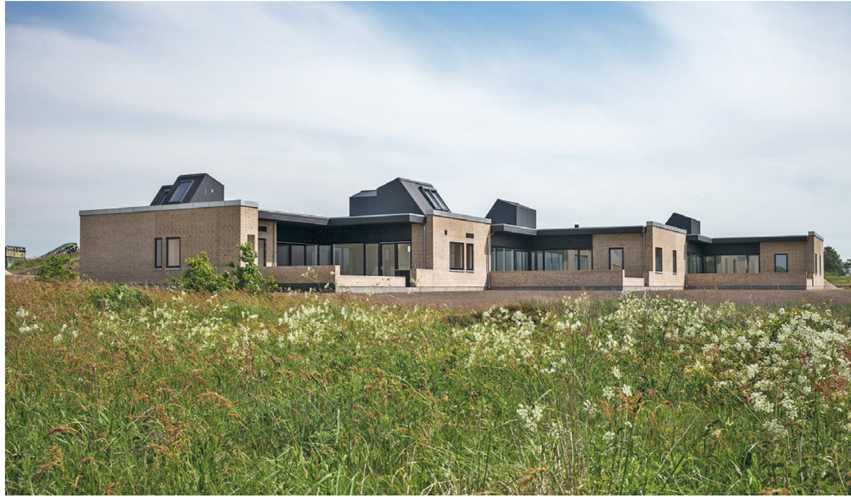
↑ Healthy Homes, Holstebro ↓ Communal Housing for the Elderly, Ringkøbing