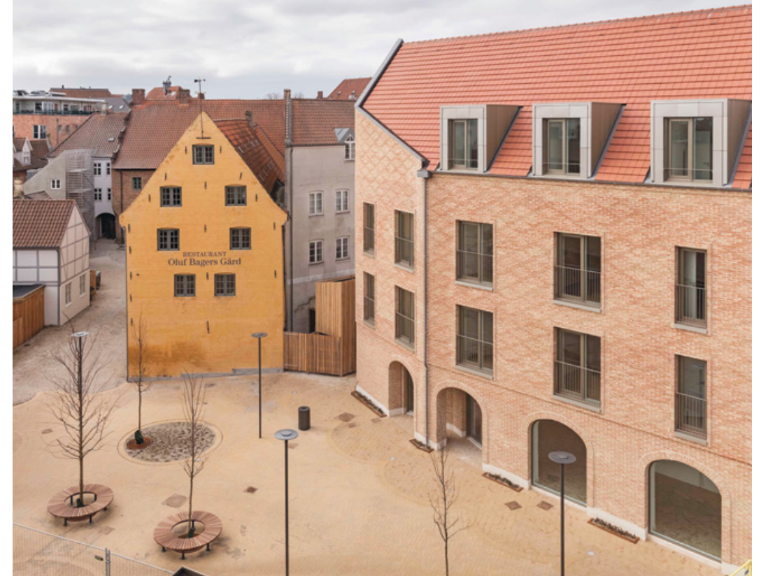
↑ Oluf Baggers Square, Odense

In the new building "Tietgen's Agony" , the challenge was to build on the last unbuilt corner plot in a homogeneous block of flats surrounding