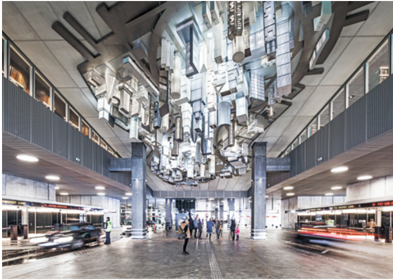
↑ DOKK1 Parking, Aarhus ↓ Healthy Homes, Renovation, Randers