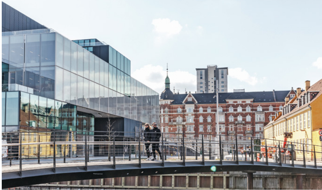
↑ BLOX ↓ Tietgen's Agony