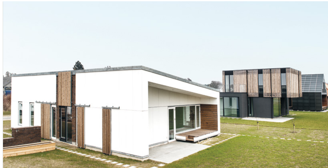
↑ The Fortification Depot, Copenhagen ← The Mini CO2 Houses, Nyborg