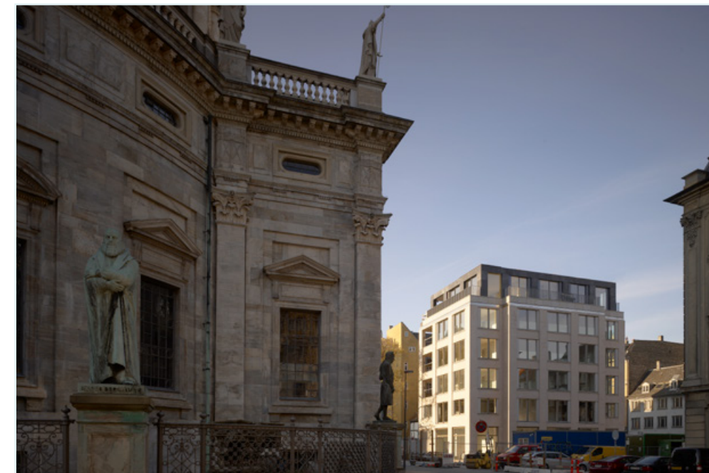
↑ The MiniCO2 Houses, Nyborg → Tietgen's Agony, Copenhagen