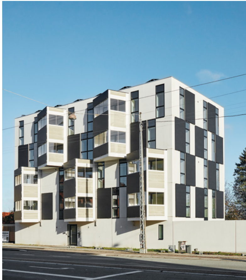
← BOLIG+, Søborg ↓ The Modern Seaweed House, Læse